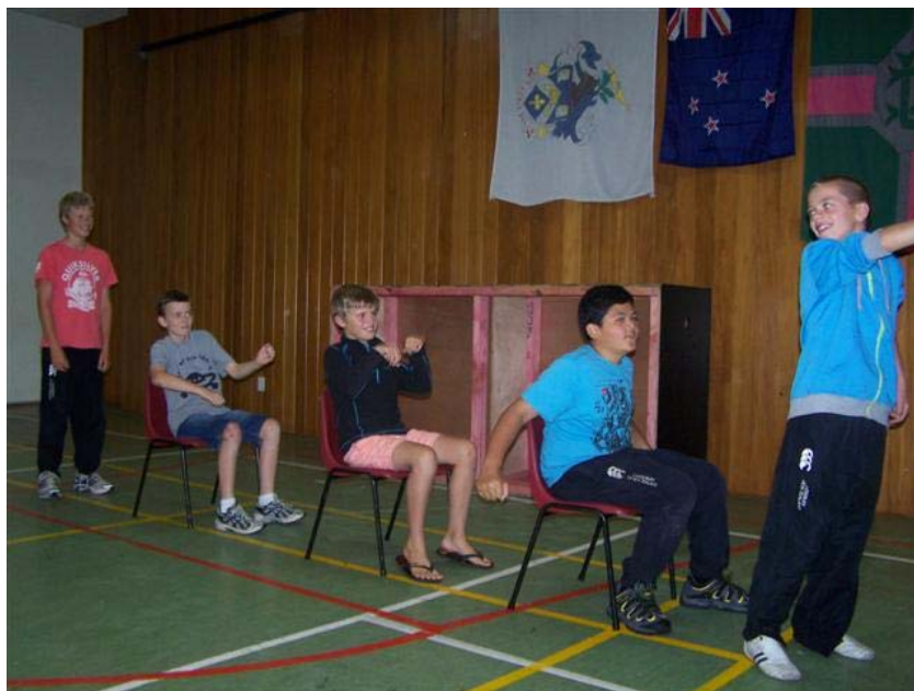
Kupe and Ngarimu