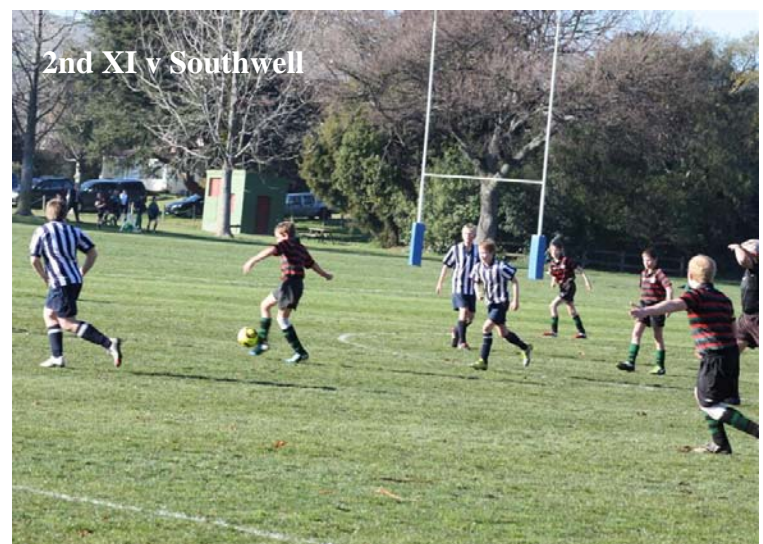
2nd XI v Southwell