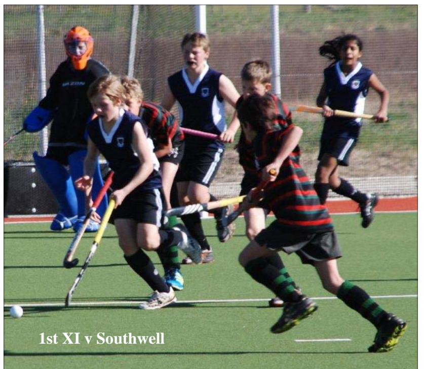
1st XI v Southwell