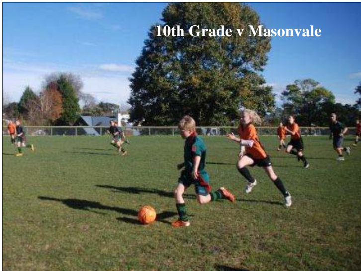
10th Grade v Masonvale