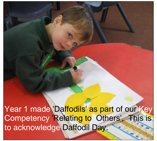
Year 1 made 'Daffodils' as part of our Key Competency 'Relating to Others'. This is to acknowledge Daffodil Day.