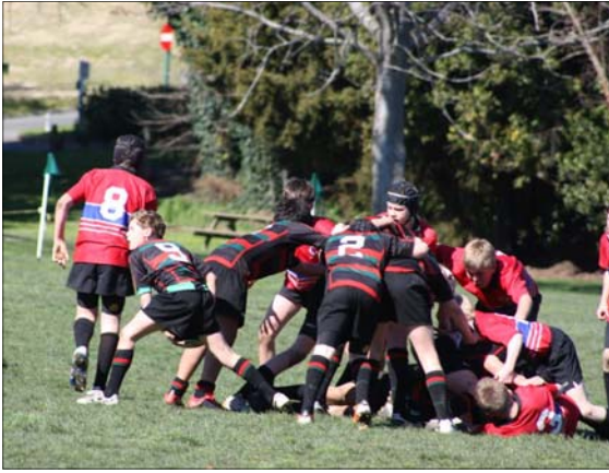
1st XV v Medbury